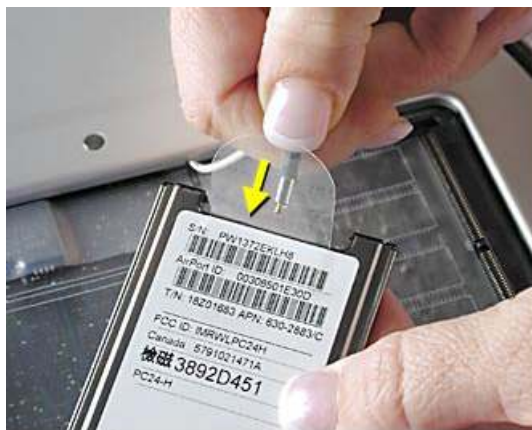
Figure 6 Insert the antenna to connect it

1. Connect the AirPort antenna firmly to the AirPort Card (Figure 6).