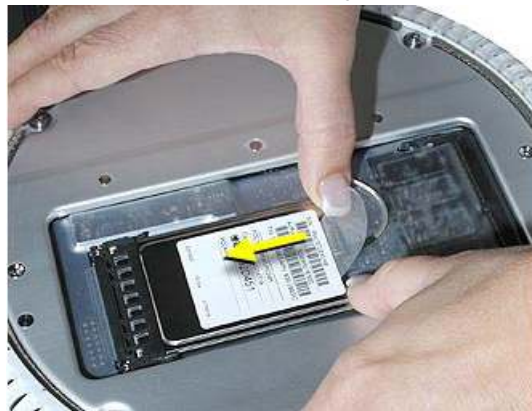
Figure 7 Insert the card into the slot

2. Insert the card into the AirPort slot (Figure 7).