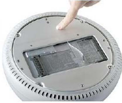
Figure 4 Touch a metal surface

5. Touch a metal surface inside the computer (Figure 4).