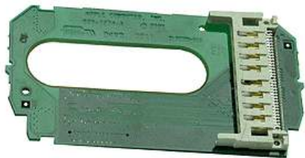
Figure 1 AirPort adapter

Note: If your AirPort Card came with the AirPort adapter (shown in Figure 1) remove the metal clip and pull the AirPort Card from the adapter. The adapter and metal clip are not used with the iMac (Flat Panel) computer.