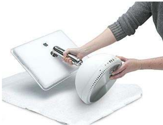
Figure 2 Lay down the computer